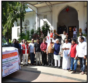
the Munda tribe and the Janajatiya Gaurav Diwas is celebrated annually on his birth anniversary. The Indian Red Cross Society,

Telangana Governor Jishnu Dev Varma flagged off four trucks containing winter relief materials for tribal villages on Thursday, January 2. The initiative is a part of the year-long celebrations for the 150th birth anniversary of Bhagwan Birsa Munda. Birsa Munda was an Indian tribal independence activist from